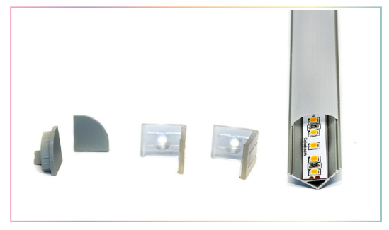
ACCESSORIES/END CAPS & CLIPS