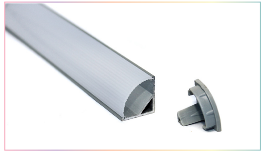
SLIM ALUMINUM TRACK