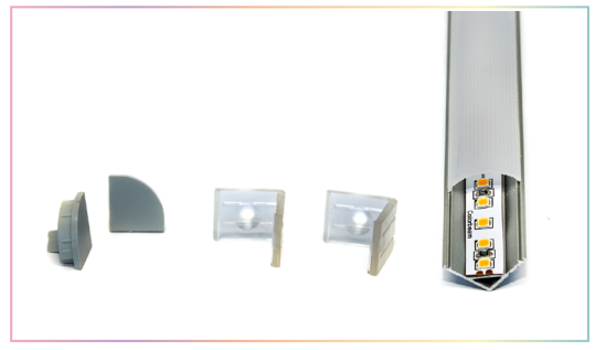
ACCESSORIES/END CAPS & CLIPS