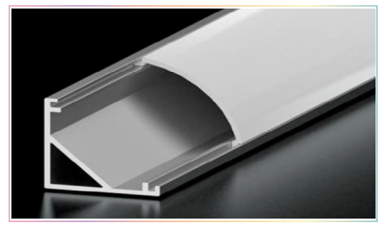
SLIM ALUMINUM TRACK