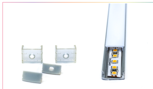
ACCESSORIES/END CAPS & CLIPS