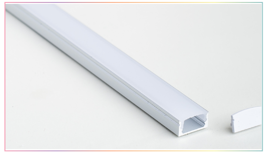
SLIM ALUMINUM PROFILE