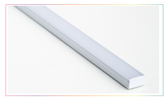
ACCESSORIES/END CAPS & CLIPS