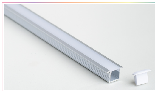
ACCESSORIES/END CAPS & CLIPS