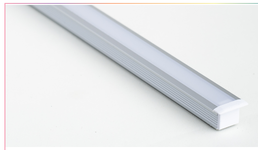
SLIM ALUMINUM PROFILE